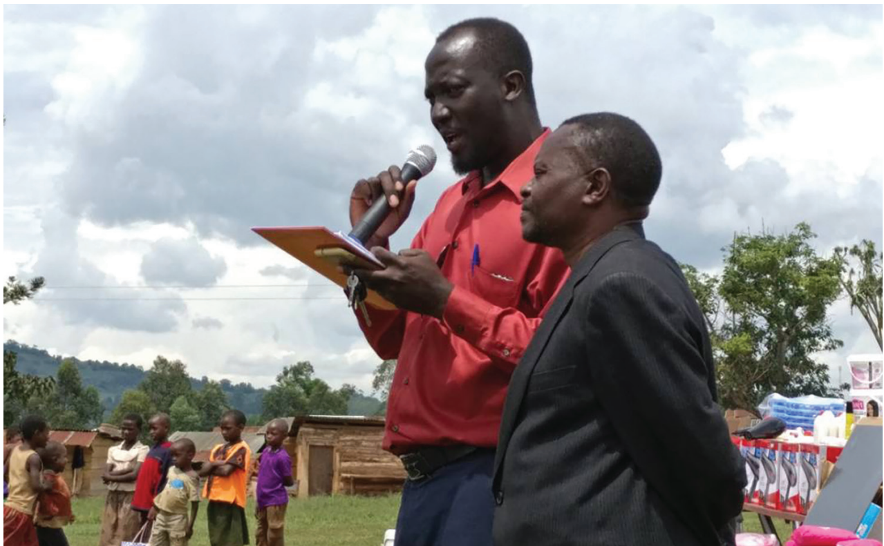
Graduation celebration for girls supported by the Emergency Child Protection Response.

In addition to the changes at the World Bank itself, pressure from the World Bank also led to significant change at the Ugandan government level. This pressure came in the form of suspension of other Bank-financed road projects, followed by suspension of all new lending to the country. In part due to World Bank pressure, but also due to internal corruption-related issues, the head of UNRA was replaced, the staff were all fired and made to reapply for their jobs, and significant work was done to address the rampant corruption within the agency. The World Bank sent regular teams of specialized staff to assist UNRA in implementing these reforms and strengthening its capacity to implement World Bank safeguards in future projects. UNRA also created and adopted a child protection policy that will be applied to all projects, regardless of their source of funding. Many of these changes have been mandated by the World Bank as a precondition for UNRA to implement Bank-funded projects, but will potentially help to prevent harm in projects beyond those in which the Bank is involved.