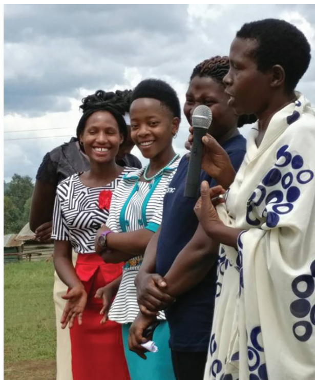
Graduation celebration for girls supported by the Emergency Child Protection Response.

Additionally, the World Bank created the Gender Based Violence Task Force, made up of high-level experts from United Nations bodies and NGOs, along with representatives of Bank management (World Bank, n.d.). The creation of the task force was announced in a press release, shopped around to many major media outlets by the World Bank's press office, on the exact day that the Inspection Panel's report went to the Board of Directors (World Bank 2016c). A second press release, announcing the composition of the task force, was put out on the exact day that Bank management sent its action plan to the Board of Directors (World Bank 2016f). The Bank clearly felt the need to advertise the creation of this task force, and to time that advertisement to coincide with the release of materials that criticized the Bank's actions in Uganda.