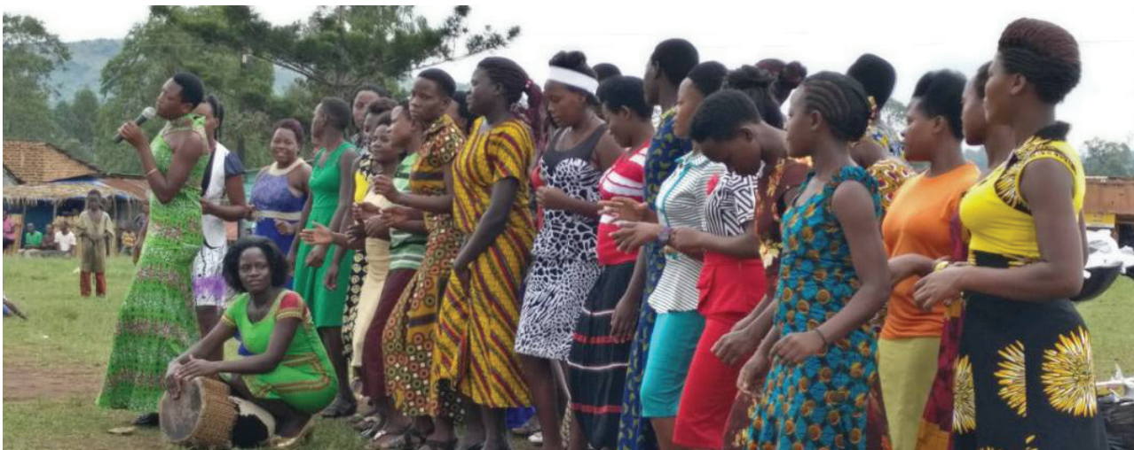
Graduation celebration for girls supported by the Emergency Child Protection Response.

The World Bank-funded Uganda Transport Sector Development Project (TSDP) is one such case and demonstrates the horrifying impacts that can be visited on local communities when multilateral development banks (MDBs) fail to supervise and monitor adequately the large infrastructure projects they finance. At the same time, this case demonstrates the positive influence that MDBs, particularly the World Bank, can have in ensuring that communities are supported and protected from the worst harms of such projects. The World Bank’s independent accountability mechanism, the Inspection Panel, provides an opportunity for those who suffer as a result of Bank investments to obtain redress. The accountability mechanisms can recommend not only direct support for those who were harmed by the project but also project-related changes to prevent future harm, as well as system-wide Bank reform aimed at improving Bank projects generally. This note examines the ways in which the TSDP is exceptional, including the way the Bank responded constructively rather than antagonistically to the complaint, the extent to which it was willing to propose systemic change in the wake of the case, and the factors that led to its extraordinary responsiveness.