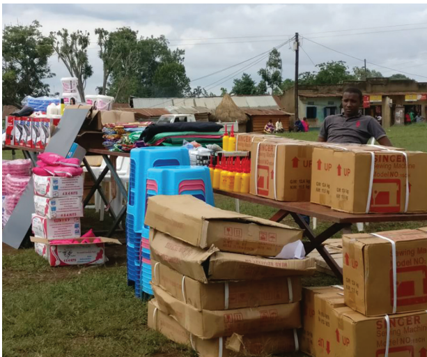
Materials provided to girls who received skills training under the Emergency Child Protection Response.

The Bank's particular willingness to learn and apply lessons in this case can be seen as an example for how accountability should work in the development context more broadly. While there are several other notable cases where the World Bank has enacted major reform in the wake of a "problem project," this is not the norm. The Bank, when caught in misconduct will generally remediate the particular harm experienced in the given case while keeping the same systems in place, allowing the problem to reoccur in future similar projects. The dynamic that occurred in this case, with sustained external scrutiny from civil society and the media coupled with an openness within the highest levels of the World Bank to learn lessons from this case, was unique. However, it was this dynamic that allowed the Bank's accountability structures to work as they truly should, catalyzing the type of institution-wide reform that, if properly implemented, will allow the Bank to prevent similar harm in the future, significantly improving its ability to deliver on its mission to end poverty.